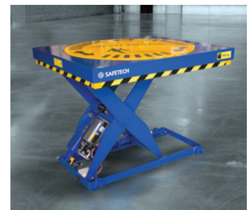
User-friendly lift controls

Applications include: Pharmaceutical, cold storage, Retail DC, warehousing, food.